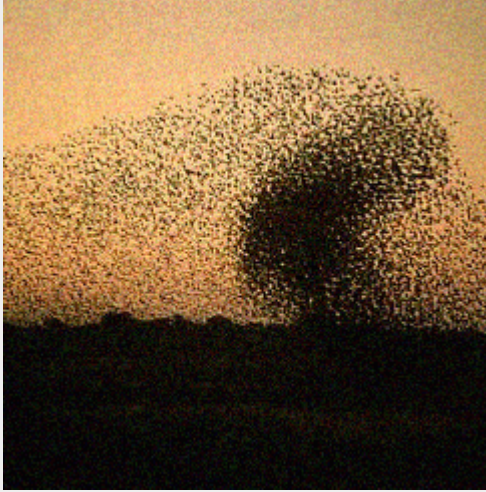
Imaging a swarm

To understand this better let's look at the picture below and imagine that red dots are IoT devices that can send and receive and black ones are clients that gather data.